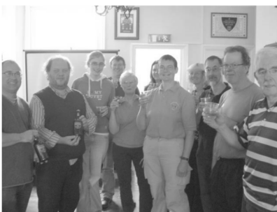
Meet the Cider Maker at the Duke of York

We also tried using the service bus to get out on a Saturday. That means we can run a trip more than once depending on when people are free. We went to Shrewton on two Saturdays in November with 1 and 6 people on each trip. On the second visit the Royal Oak had Plain Ales Innocence and Box Steam Tunnel Vision on offer which went well with the soup and baguette while the George had Stonehenge Great Bustard and Pigswill we had a bus to catch so didn't try the Rev James. Once again all the beers were very good so it makes our Good Beer Guide decisions very difficult.