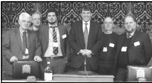
Salisbury CAMRA meet John Glen MP

Government policy in increases in tax on beer and the VAT rise are fuelling a shift in beer consumption away from pubs with over 50 having shut in Salisbury postcode area since the year 2000 alone. Half of all