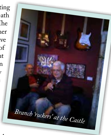
Branch 'rockers' at the Castle

Bruton is an ancient place with private schools, Sexeys and Kings, a large outlet/gallery of Hauser and Worth and a railway station so it's little wonder that new 'sexy' establishments such as @thechapel will no doubt be the new 'pub'.