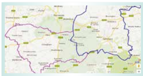
Map of the Branch Areas.