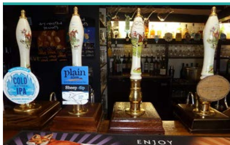
Real ales are important at the Malet Arms