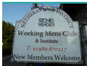
The club sign welcoming new members