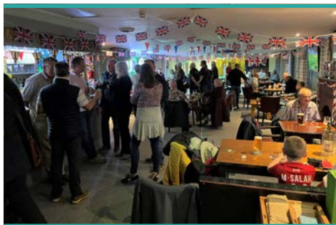
The Club on certificate presentation night

going. It was not surprising that the solution to its financial crisis came from within the community because it contributes so much to village life. Boxing Day is a big family event at the club, a free curry is served on Remembrance Sunday, there is a ‘Netheravon’s Got Talent’ night and an annual three-course dinner with wine and entertainment for its life members at just £5 a head. It acts as a community ‘warm space’ for those struggling with their heating bills, and runs darts and skittles competitions and a quiz.