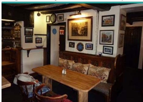
The pub's historic interior