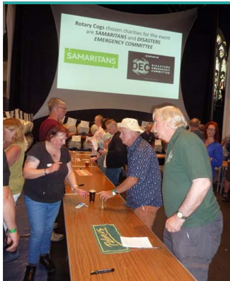
Beerex, Salisbury's summer beer festival, is a joint project between Wiltshire Creative, which runs

sold out and the remaining three had only 7.75 gallons left between them when the festival closed. As well as a huge range of real ales, there were 15 ciders and perries on offer.