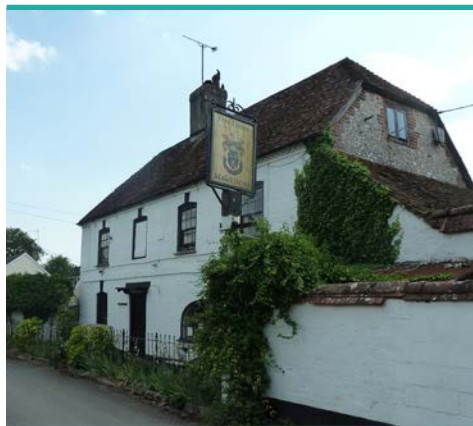
The Malet Arms