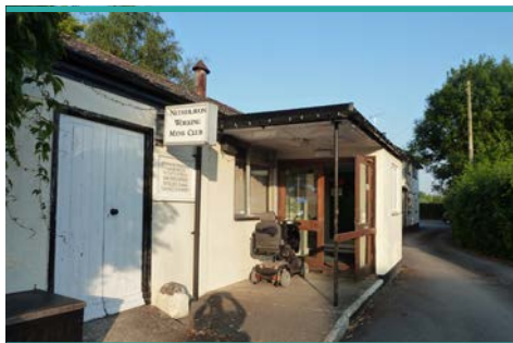
The outside of the Club building - in service for 98 years