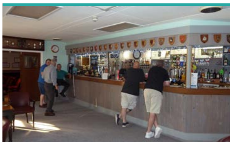
The smart interior of the bar

The sense of continuity at the club is its other defining characteristic. After starting up in a small hut in what is now the school playing field, it moved into its present site just off the High Street in 1925, acquired a pre-fabricated hut that was being taken down at Perham Down and is still in the same building 98 years later.